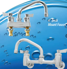
1/2" Backsplash Mount Faucet

For reliable, tough faucets, choose Fisher. Our 1/2" Faucets feature Stainless Steel Seats guaranteed for life. A ceramic disk stem system for lower maintenance. Choose from a variety of models including kitchen, lavatory, pot filler, kettle filler, service sink and dipperwell.