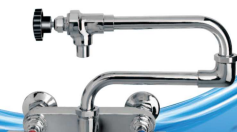
Swing Away Dual Joint Pot Filler