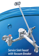
Service Sink Faucet with Vacuum Breaker

With a functional design that includes a vacuum breaker, pall hook and garden hose threads, Fisher Service Sink Faucets are the perfect solution for areas that take a lot of abuse.