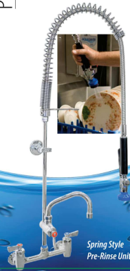
Spring Style Pre-Rinse Unit

Save thousands of dollars in utility bills by equipping your commercial kitchen with innovative Fisher Pre-Rinse Units featuring the water-saving Ultra-Spray™ Valve. Cuts like a knife while using only 1.15 gallons of water per minute at 60 psi.