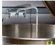
High Flow 3/4" Backsplash Mount Faucet