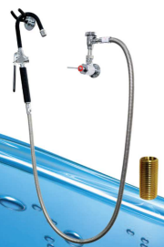
Single Deck Dual Control Valve Kettle Filler

Filling large volume kettles is often time-consuming and inconvenient, but Fisher Kettle Fillers make it easy and efficient. Their hook-shaped spout hangs on the kettle's side while filling it with water. And, a useful hook holds the faucet's spout when not in use. Choose from a variety of wall or deck mount models.