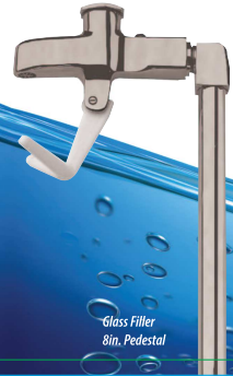
Glass Filler 8in. Pedestal

Durable yet attractive, Fisher Glass Fillers are a must for your beverage stations. Available in your choice of models to meet virtually any installation.