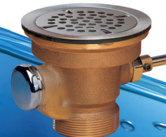
DrainKing™ Ball-Type Rotary Waste Valve

Spend more time with your customers not your sink! Fisher's exclusive DrainKing™ empties large sinks fast. It's the only Stainless Steel ball-type waste valve with two, smooth riding Teflon™ seals, post-stop action, and a 99-year warranty. (Lever Handle 1-year)