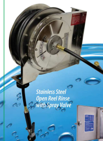
Stainless Steel Open Reel Rinse with Spray Valve

Access water anywhere in the kitchen with our powerful Reel Rinse System featuring 20', 30', or 50-foot hoses housed on retractable spools. This versatile system can pre-rinse soiled dishes, spray down work areas, clean floors and much more. Accessory kits are available to make installation a snap.